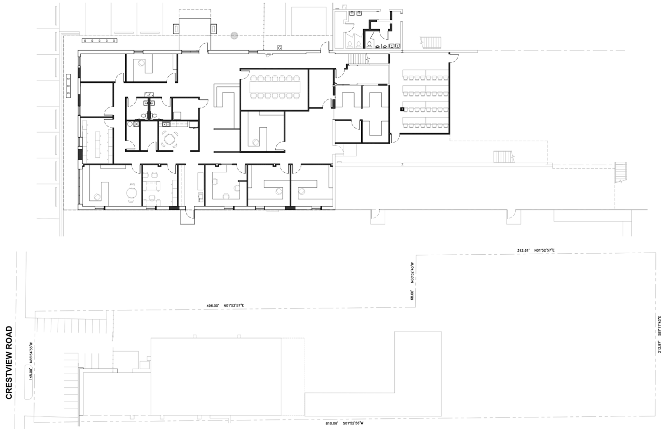
1 Architectural Site Plan Scale: 1" = 30'-0"