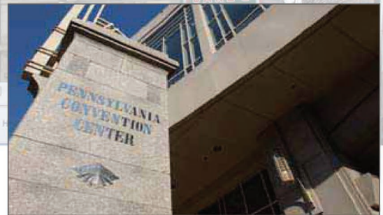
Steps from the Convention Center