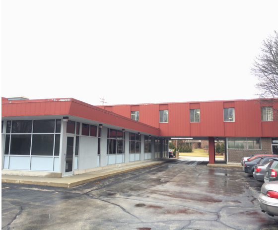
Photo does not reflect 2019 exterior paint color