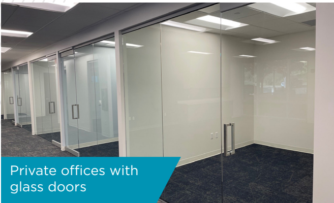
Private offices with glass doors