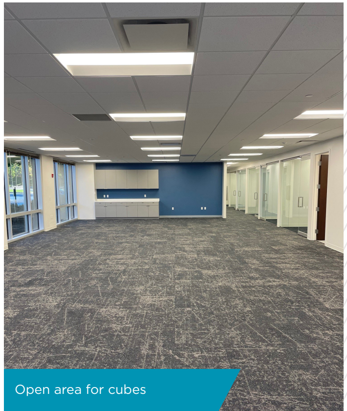
Open area for cubes