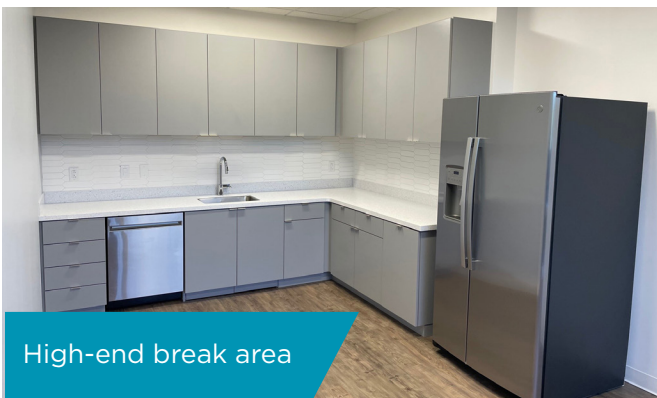
High-end break area