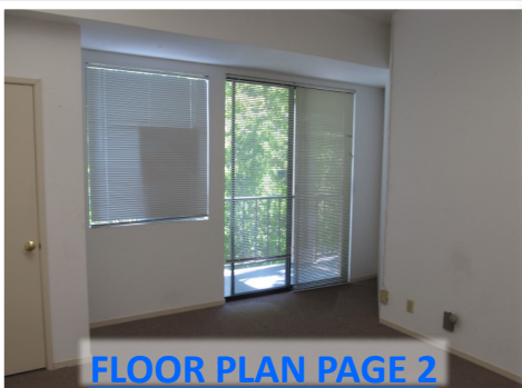
FLOOR PLAN PAGE 2