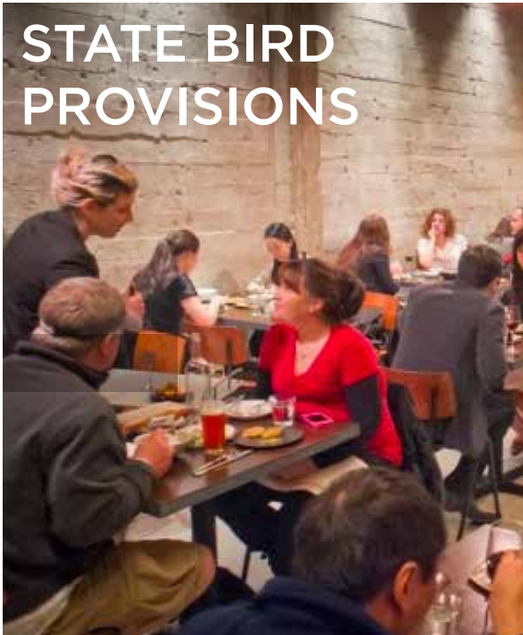
STATE BIRD PROVISIONS