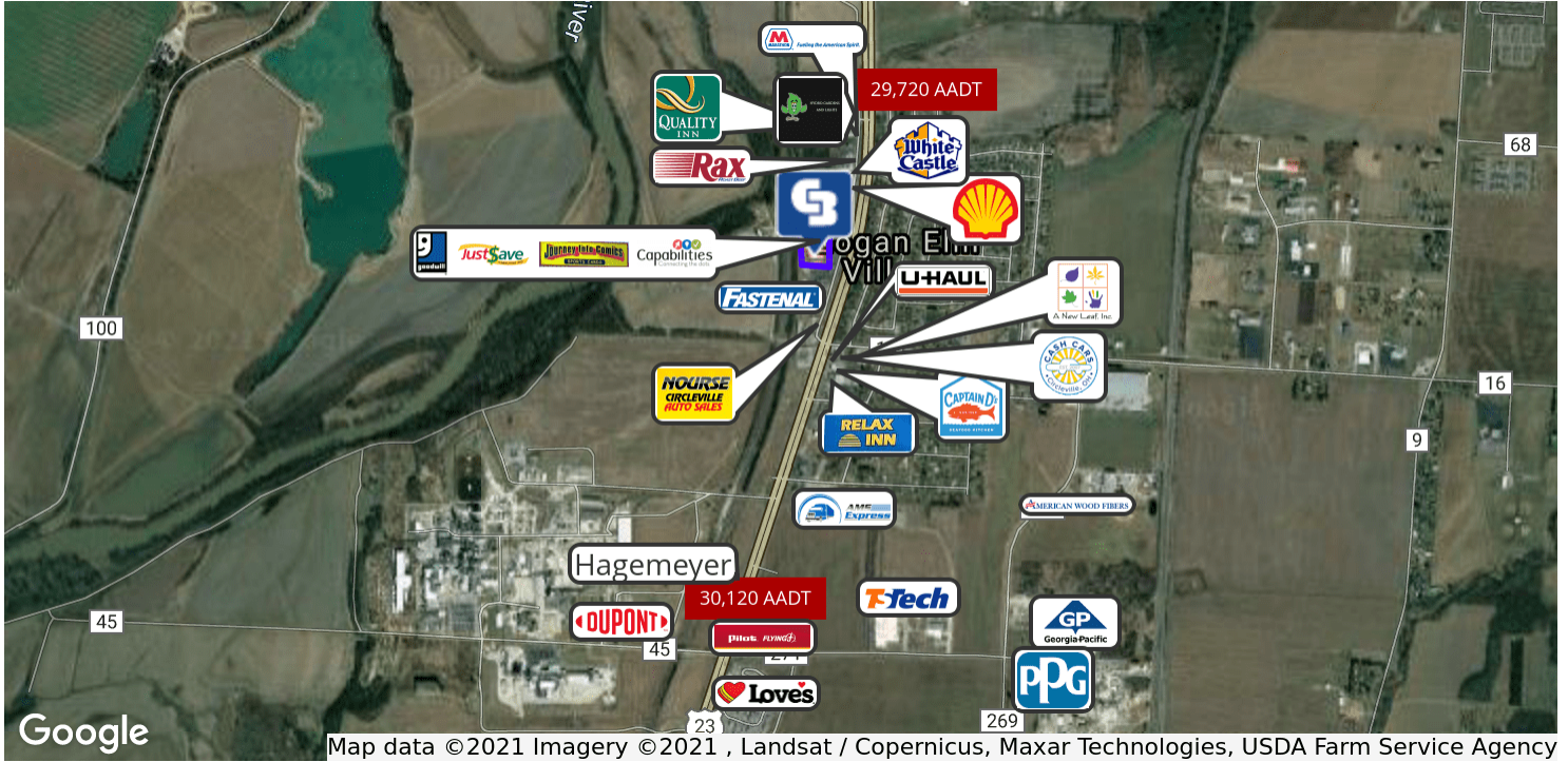
Map data ©2021 Imagery ©2021, Landsat / Copernicus, Maxar Technologies, USDA Farm Service Agency