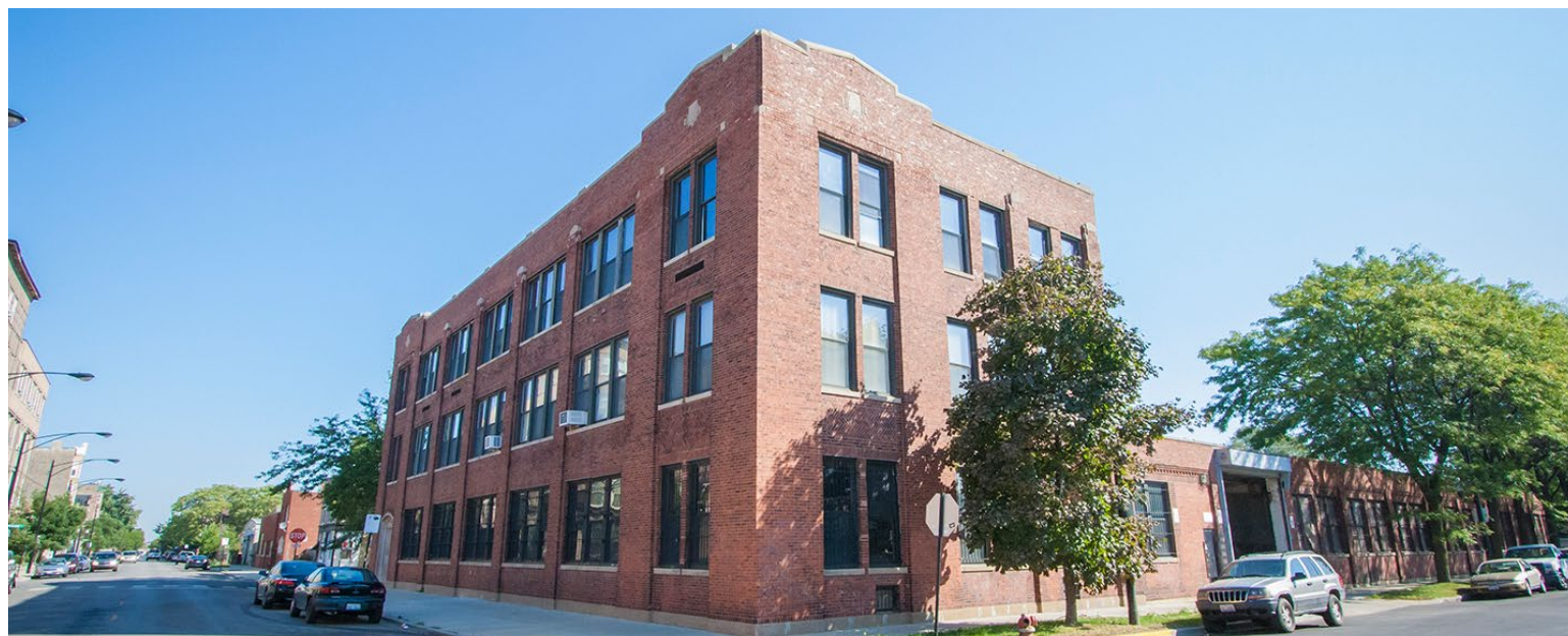
Corner Streetview from S. Racine Ave. & W. 21st St.