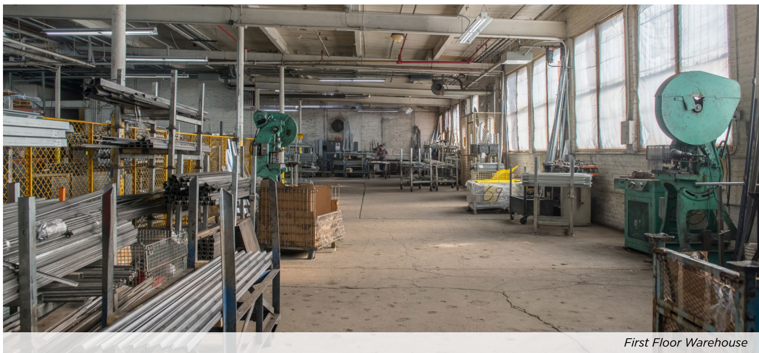
First Floor Warehouse