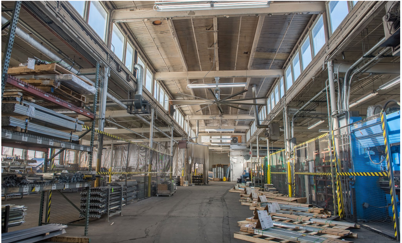
First Floor Warehouse