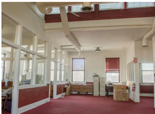
Third Floor Office