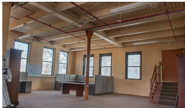
Second Floor Office