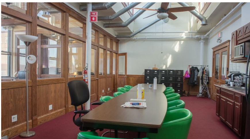
Third Floor Conference Room