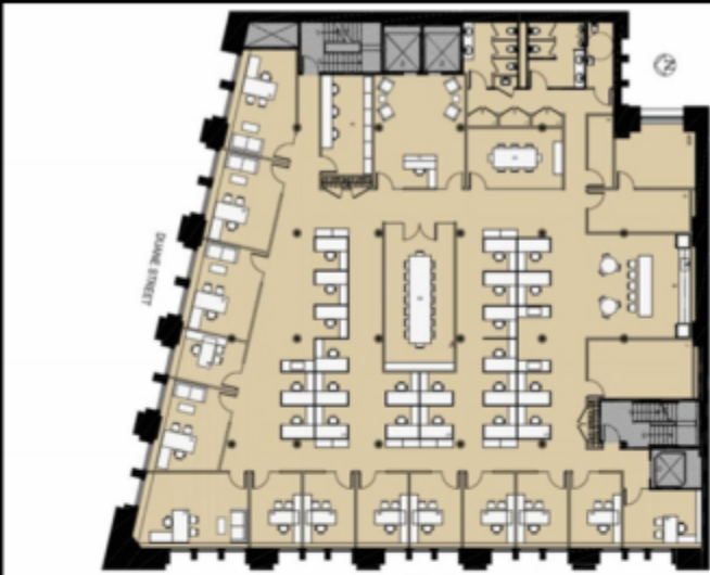
Proposed Firm Layout