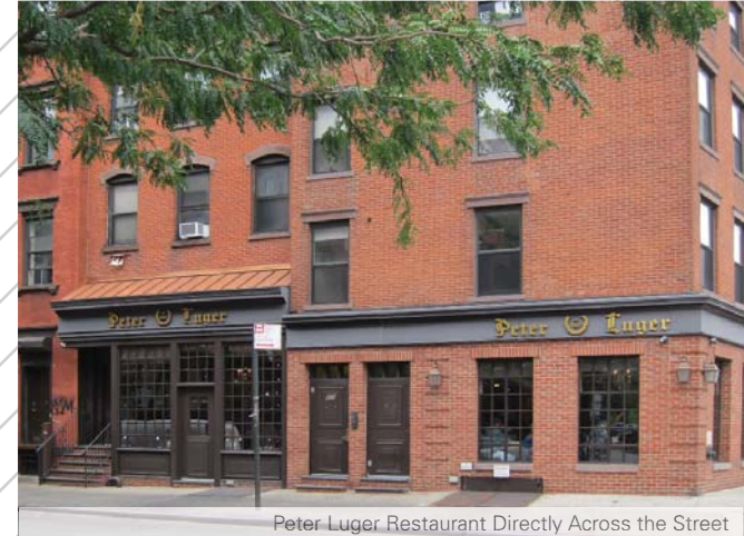
Peter Luger Restaurant Directly Across the Street

Northeast Corner of Driggs Avenue Williamsburg, Brooklyn