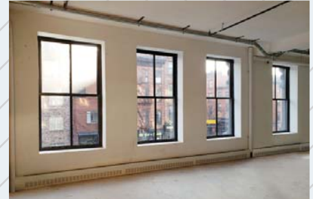
2nd Floor existing conditions

(for descriptive purposes only; not to scale.)