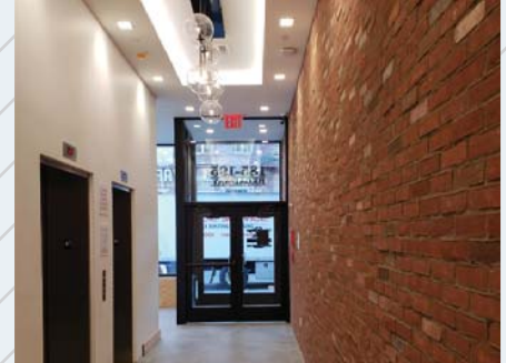
Office Entry Lobby