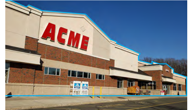
Space #17 Pre-leasing Available April 2022