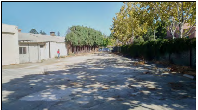
Back Parking Area

MEACHAM/OPPENHEIMER, INC. CORFAC INTERNATIONAL 8 No. San Pedro St., Suite 300 San Jose, California 95110 Tel: 408.378.5900 www.moinc.net