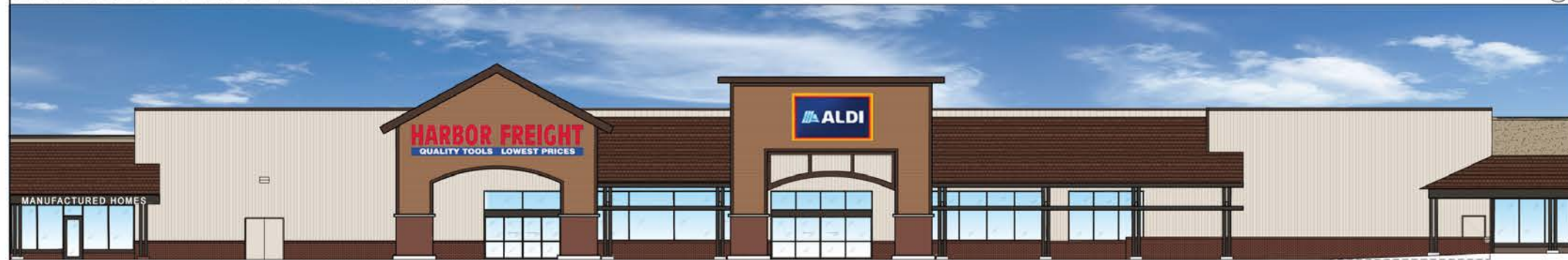
PROPOSED SOUTH ELEVATION - 13438 & 13440