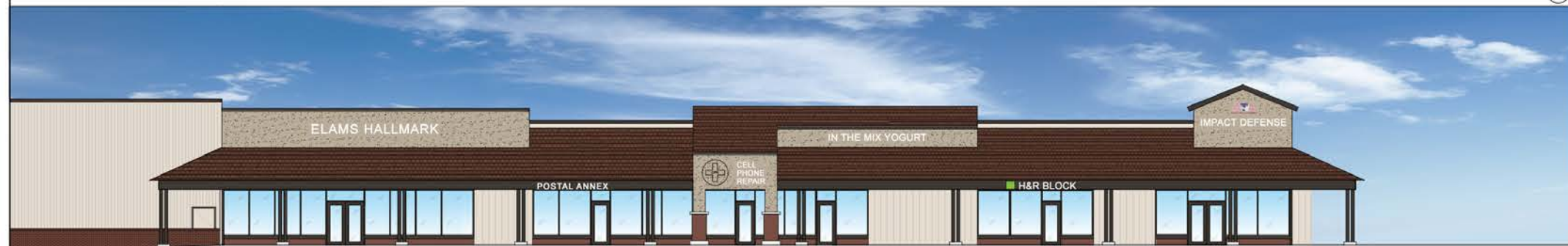
PROPOSED SOUTH ELEVATION - 1344