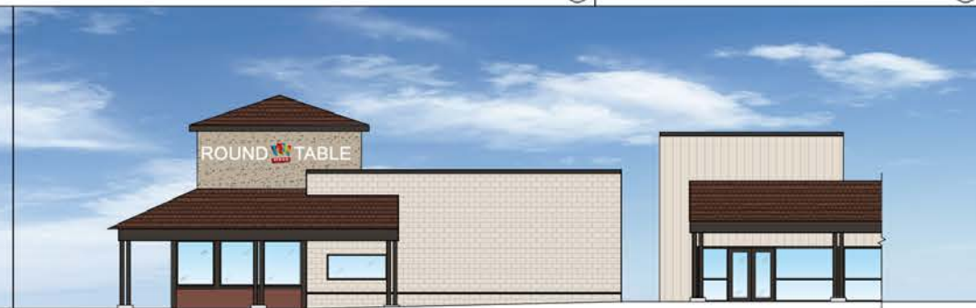
PROPOSED SOUTH ELEVATION - 13510