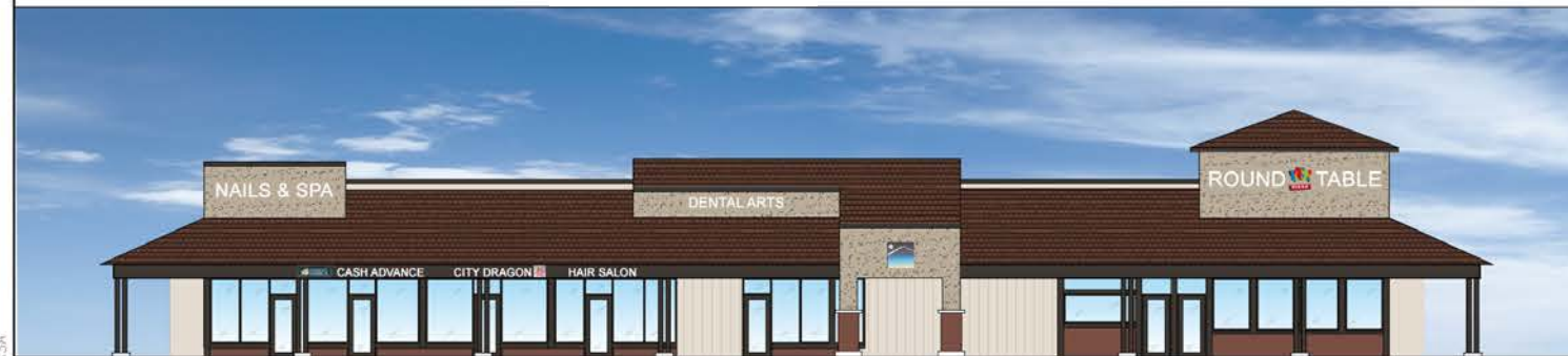
PROPOSED WEST ELEVATION - 13456 THRU 13510