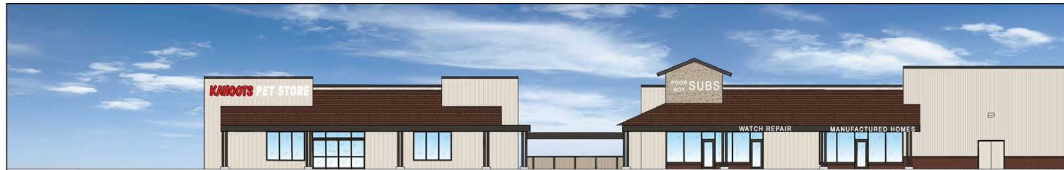
PROPOSED SOUTH ELEVATION - 13414 THRU 13436