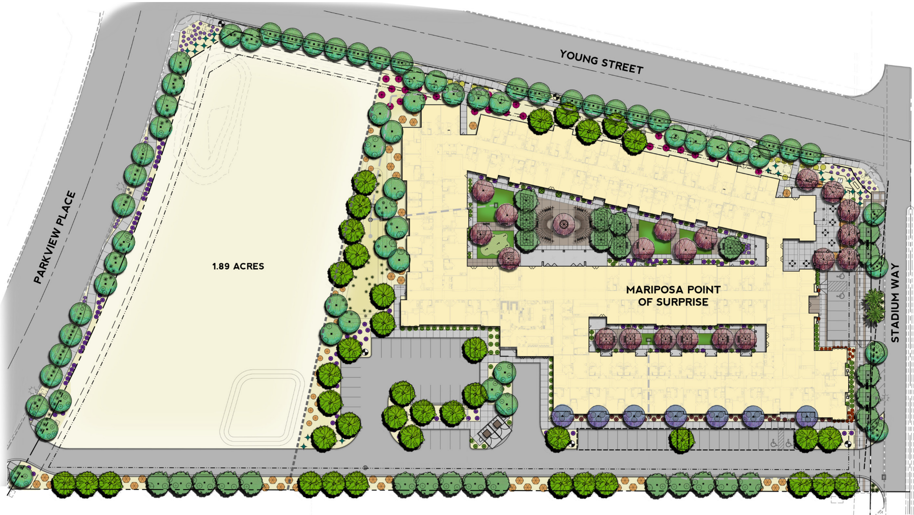
Mariposa Point of Surprise