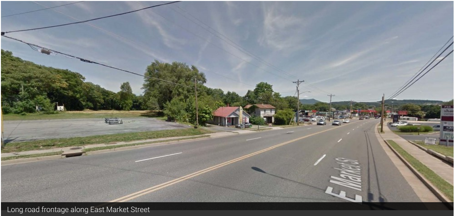
Long road frontage along East Market Street