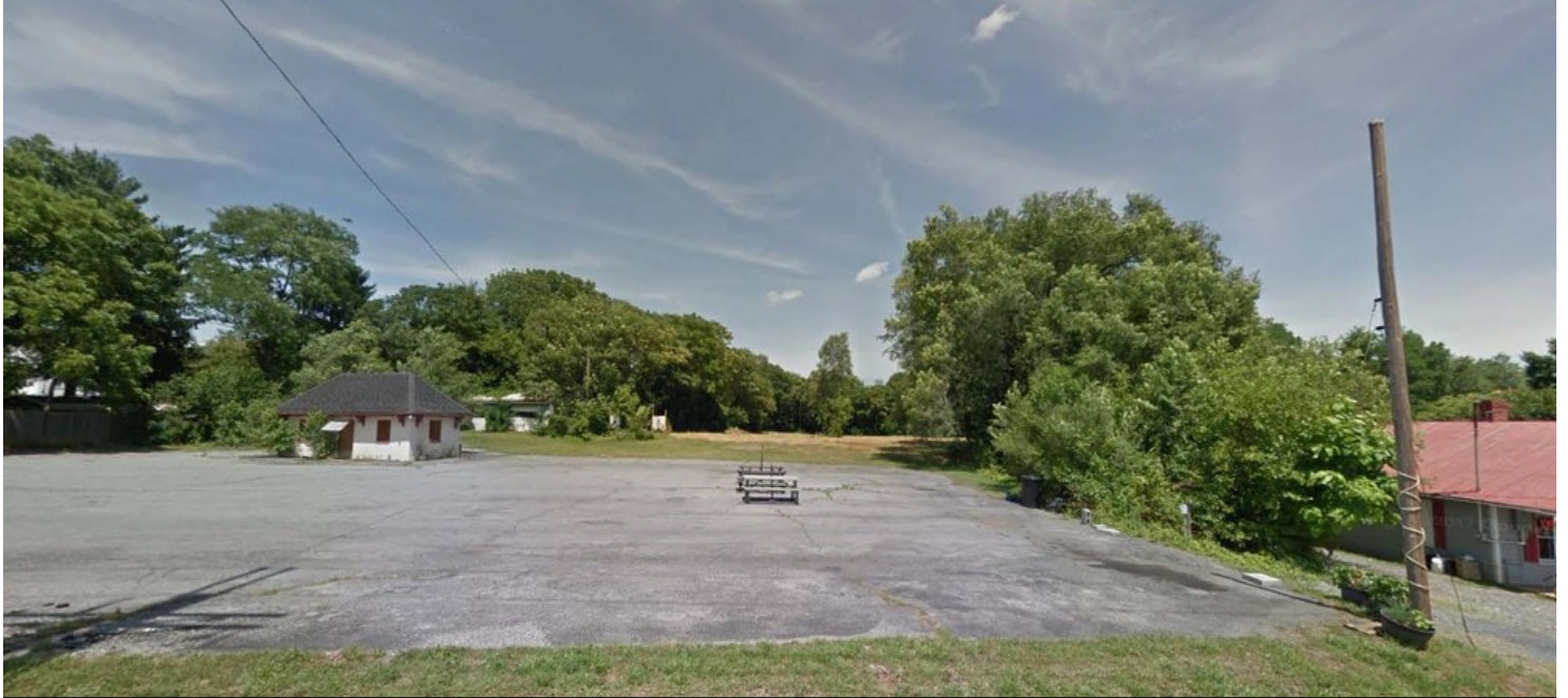
Nice level lot ready for development