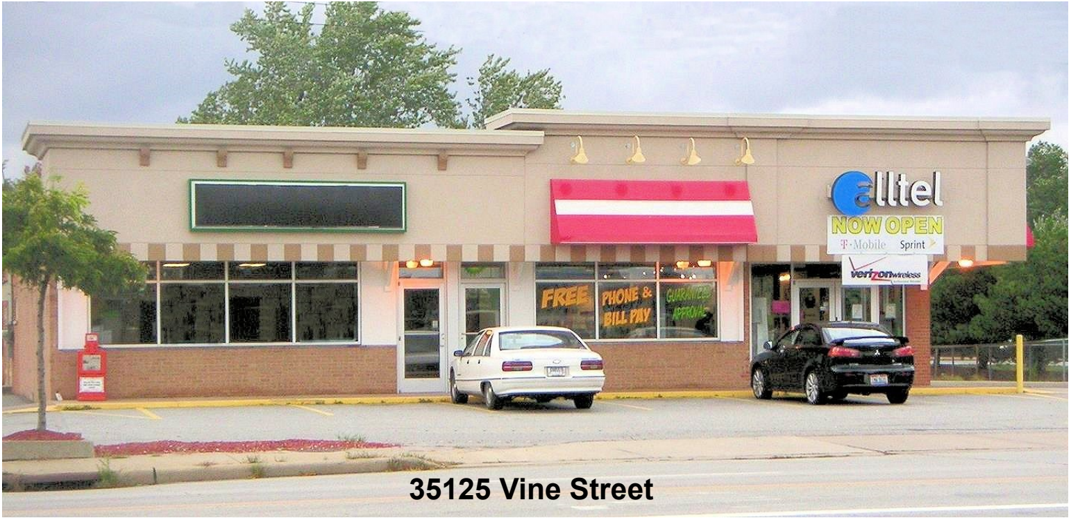
35125 Vine Street

35125 Vine Street ~ Unit 1 Available For Lease Eastlake, Ohio 44095 (Lake County)