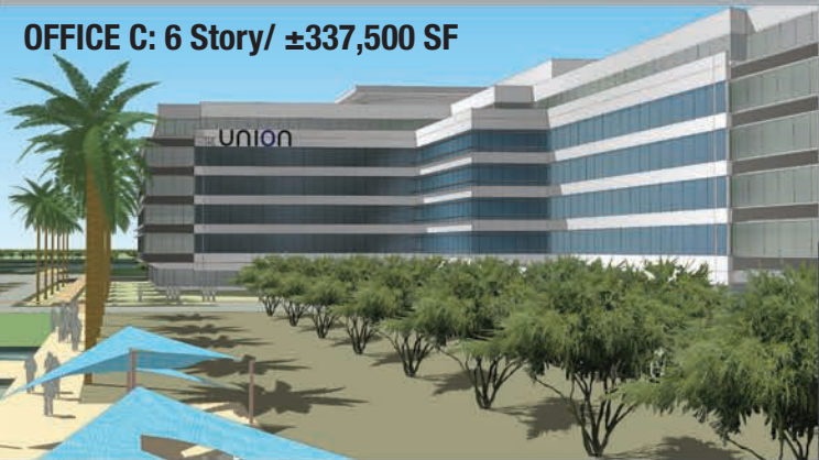
OFFICE C: 6 Story/ \pm 337,500 SF