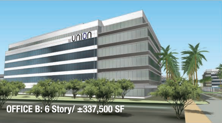
OFFICE B: 6 Story/ \pm 337,500 SF