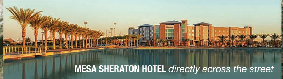
MESA SHERATON HOTEL directly across the street