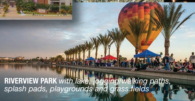
RIVERVIEW PARK with lake, jogging/walking paths, splash pads, playgrounds and grass fields