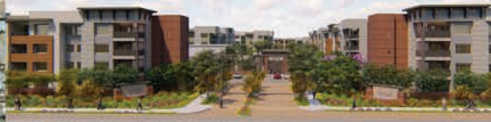
BROADSTONE RIO SALADO Luxury multi-family housing delivering Q3'19