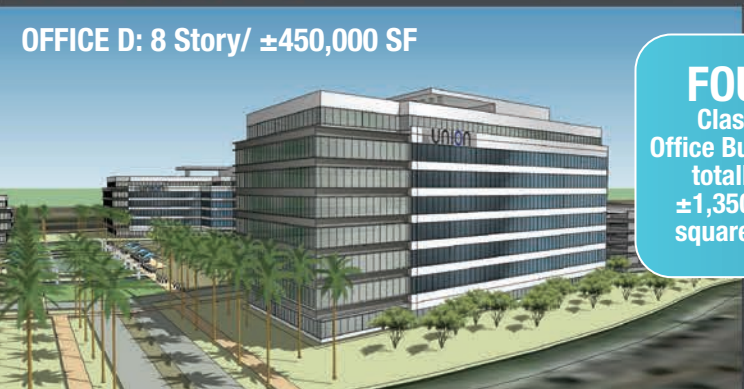
OFFICE D: 8 Story/ \pm 450,000 SF