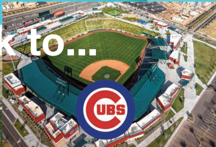
SLOAN PARK Spring Training home to the Chicago Cubs