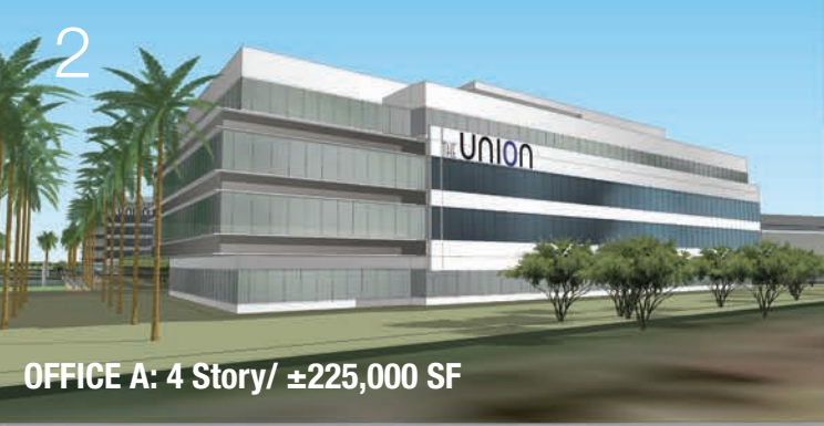
OFFICE A: 4 Story/ \pm 225,000 SF

Generous 5:1,000 parking in two adjacent 5-level structures