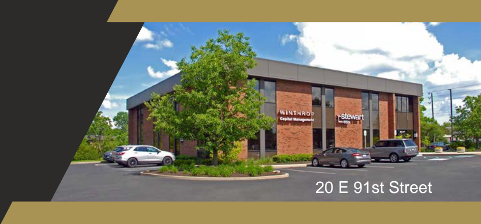
20 E 91st Street