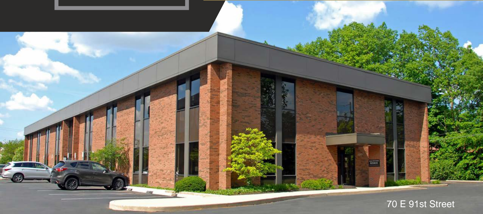
70 E 91st Street