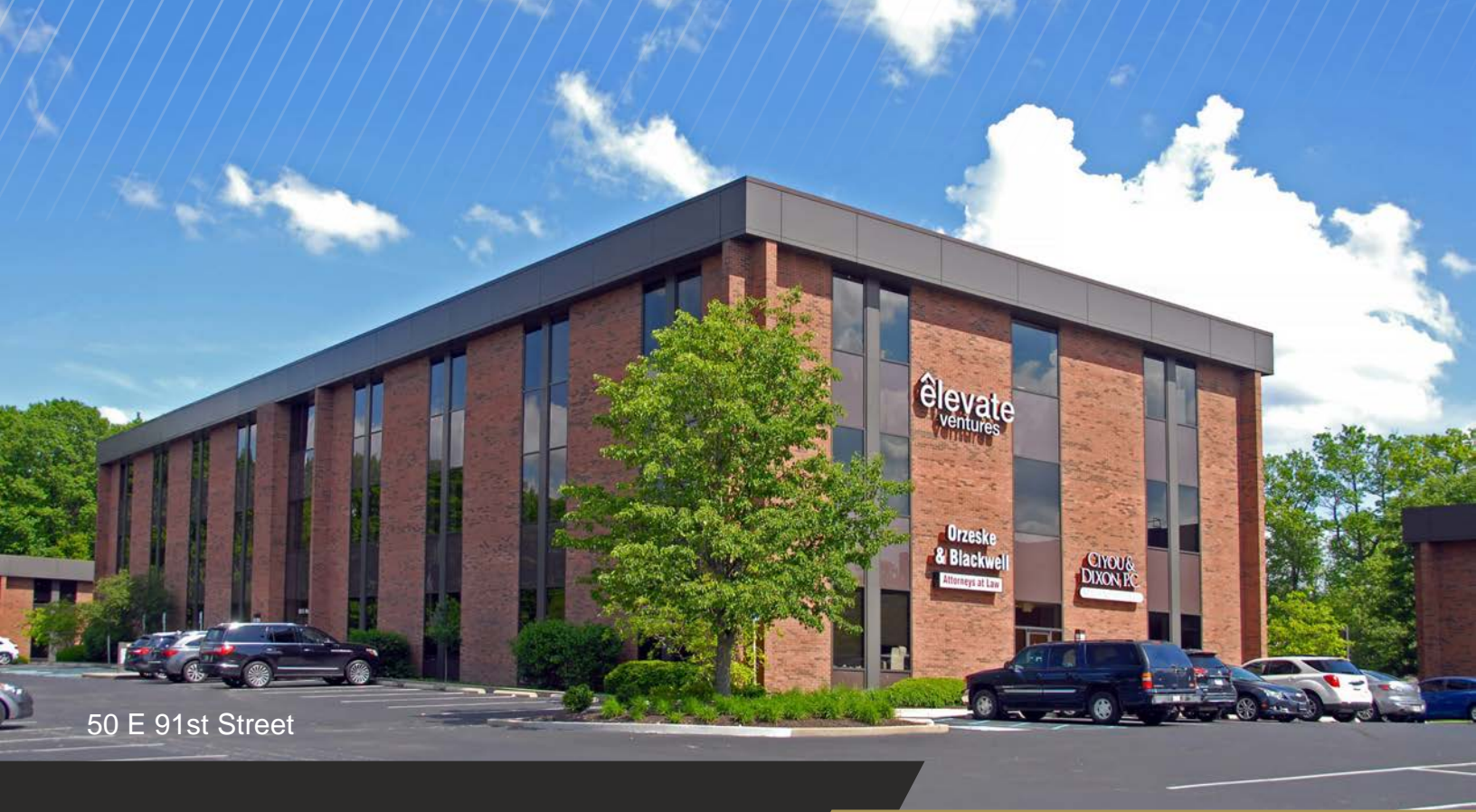
50 E 91st Street