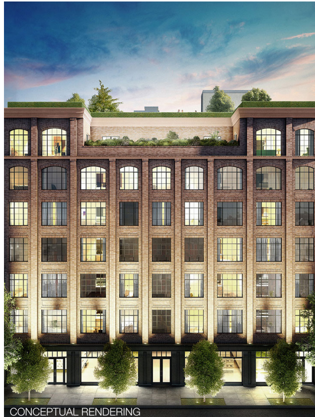
CONCEPTUAL RENDERING 50 CLINTON STREET EXTERIOR