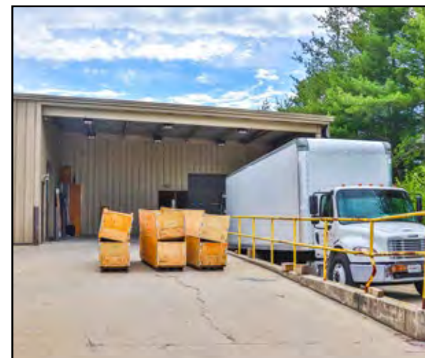
Shared truck loading dock at end of building