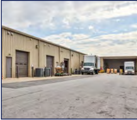
Shared loading dock

15 Design Ave., Suite 208, Arden, NC 28732