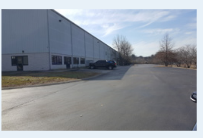
NORTH INDUSTRIAL SUBMARKET AVAILABLE JANUARY, 2019