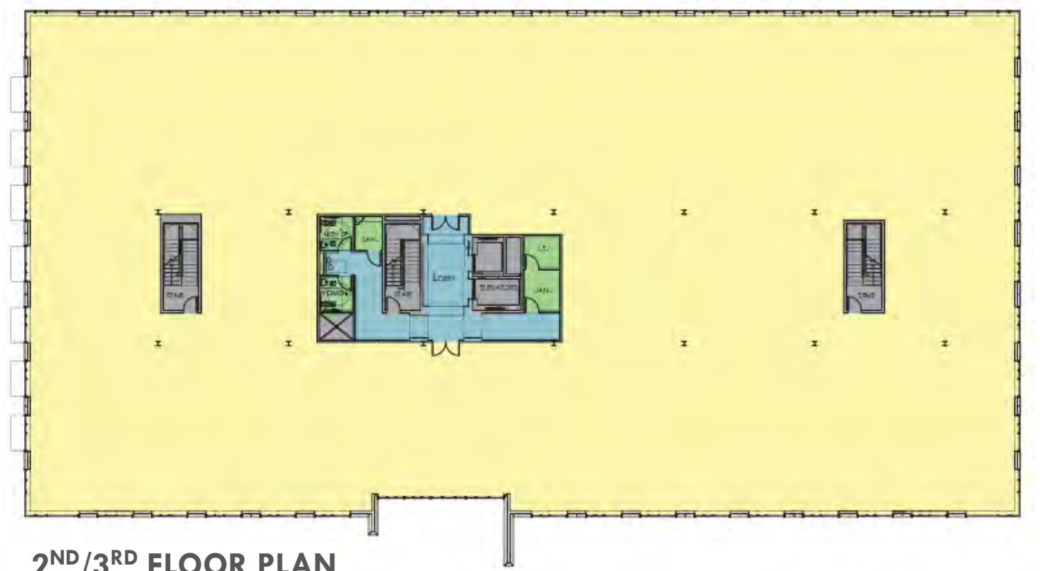
2 ND /3 RD FLOOR PLAN