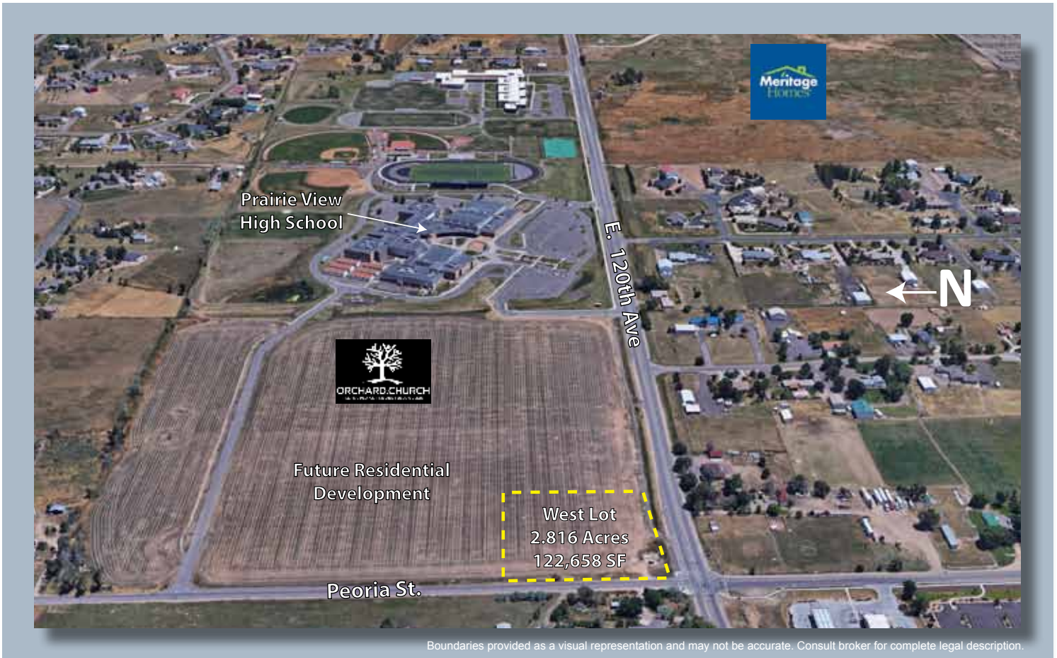
Boundaries provided as a visual representation and may not be accurate. Consult broker for complete legal description.

Lot located at the signalized northeast corner of E. 120th Avenue & Peoria Street. The newly constructed 52,000 SF Orchard Church has a weekly attendance of over 2,500 people adjoins the property on the east side. Adjacent to the east of the Church is Prairie View High School which has approximately 2,000 students. Meritage Homes is building 160 single family home to the southeast of the subject property.