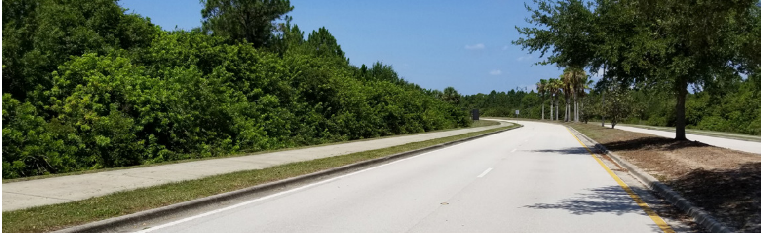
Road, sidewalks, and median in place