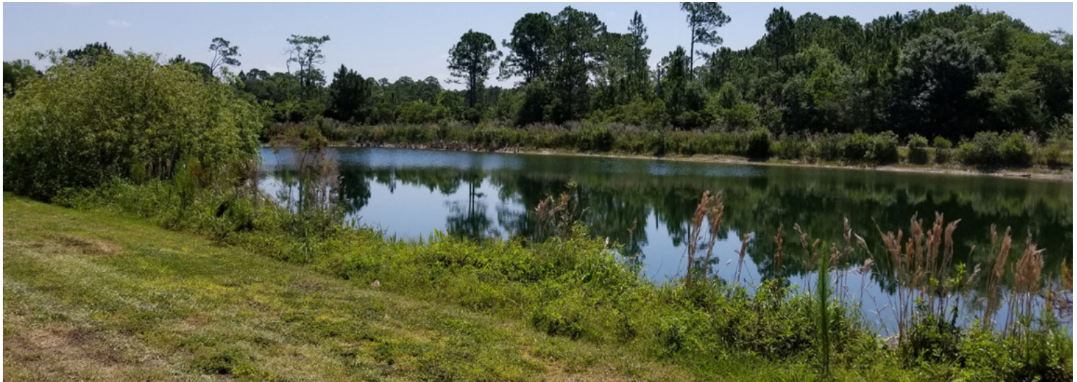
Panacea Blvd. Facing South