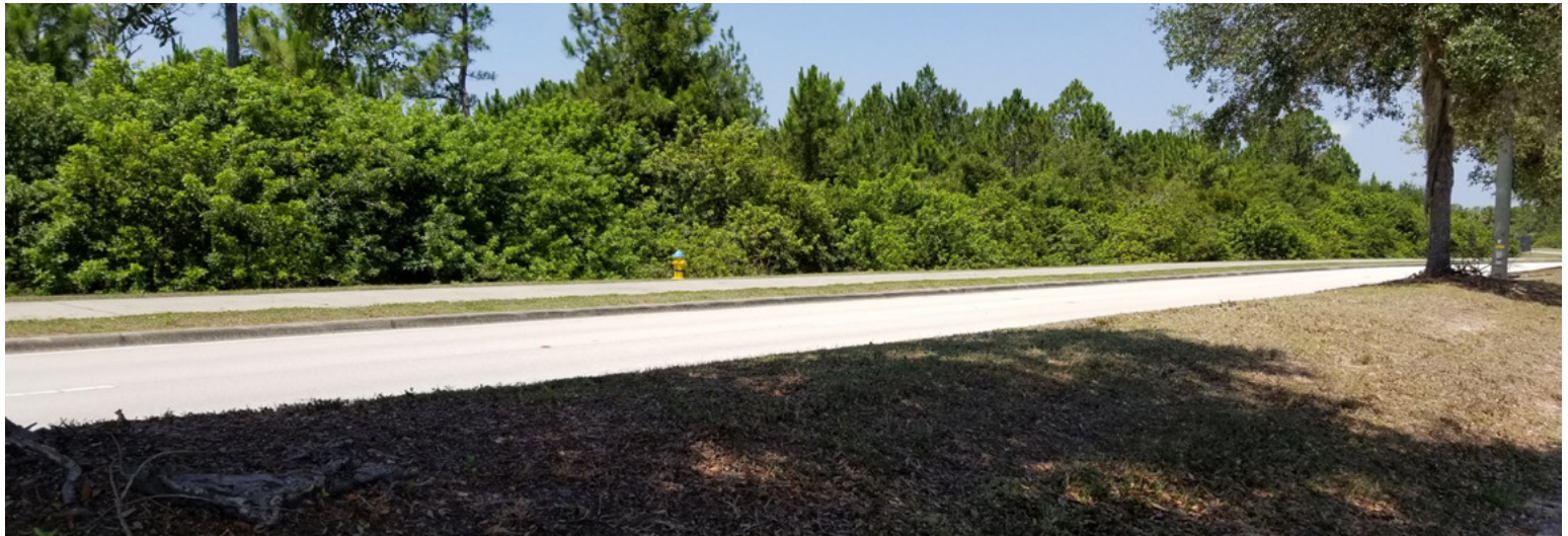
New Cypress Falls development next to site