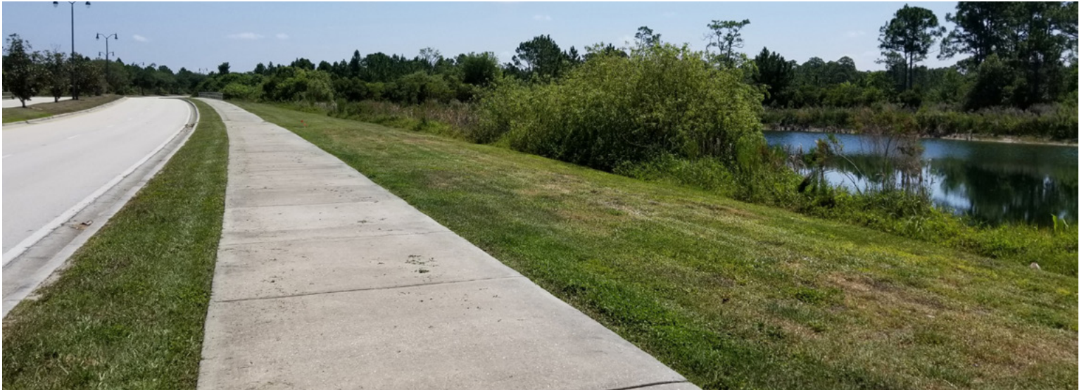
Retention Lake On Site