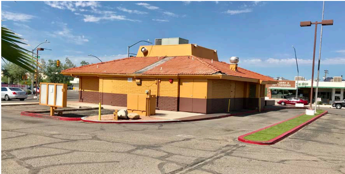
Menu Board and Drive-Thru Lane