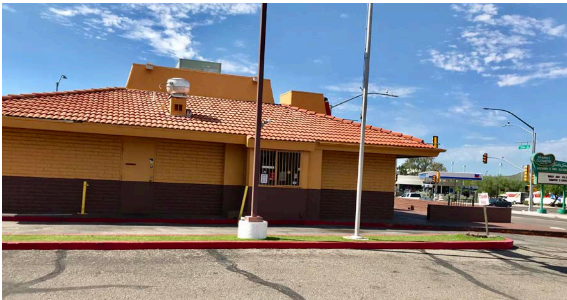
Drive-thru Window and View to Signalized Intersection