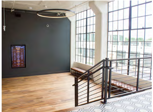
Lobbies feature state-of-the-art digital directories.