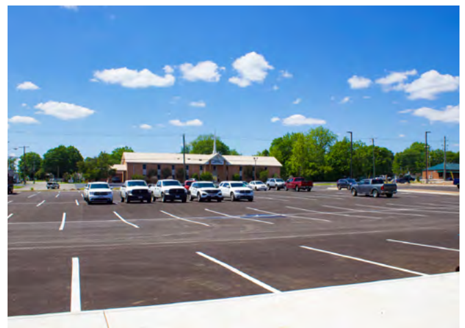
New expanded parking lot.