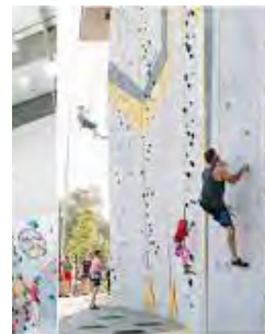
HIGH POINT CLIMBING