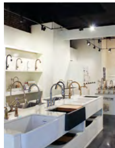
HERITAGE KITCHEN & BATH