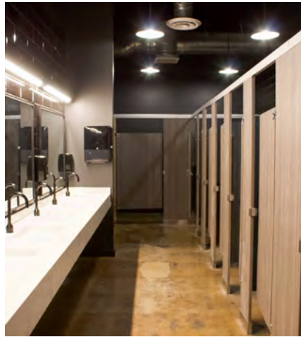
Fully renovated restrooms.