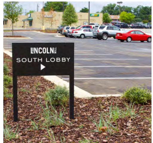
Property includes new wayfinding signage throughout.