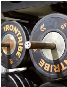
IRON TRIBE FITNESS