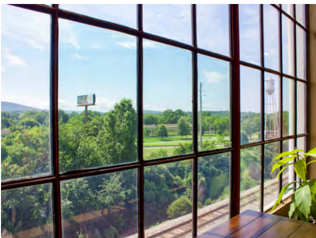
Several suites offer excellent views of Monte Sano Mountain, Downtown Huntsville, and new outdoor campus courtyard.