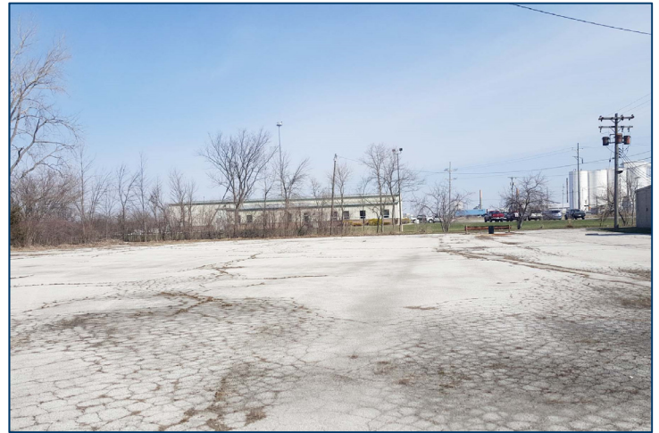
Parking for 100 cars