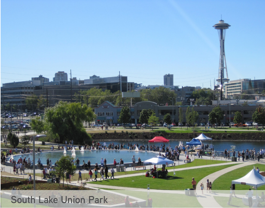
South Lake Union Park