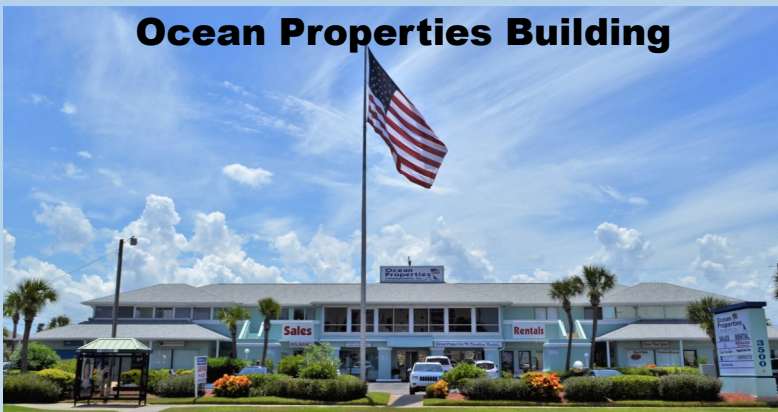
Ocean Properties Building