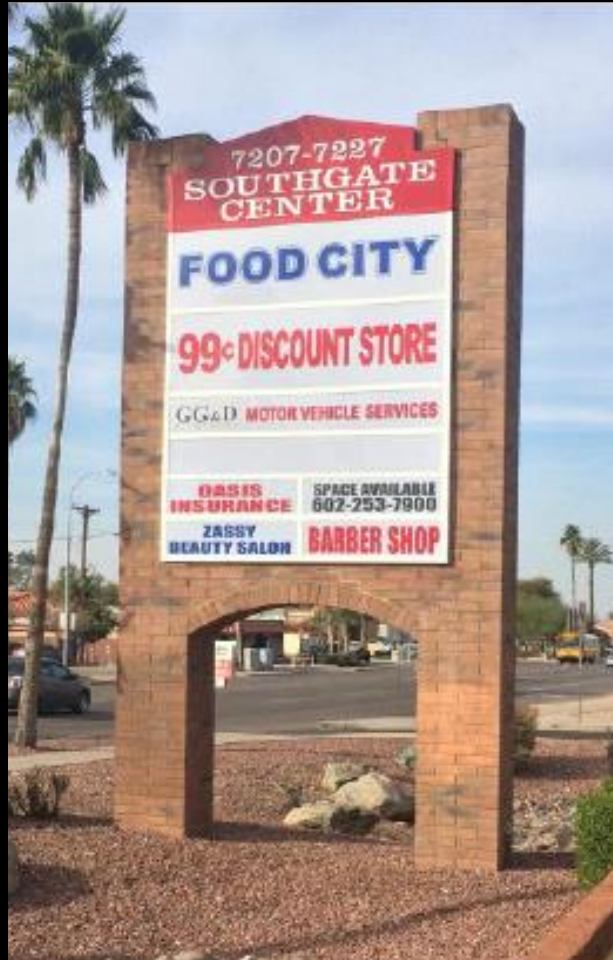
Existing Monument Sign

N/NEC Central Ave. & Baseline Rd. Phoenix, AZ