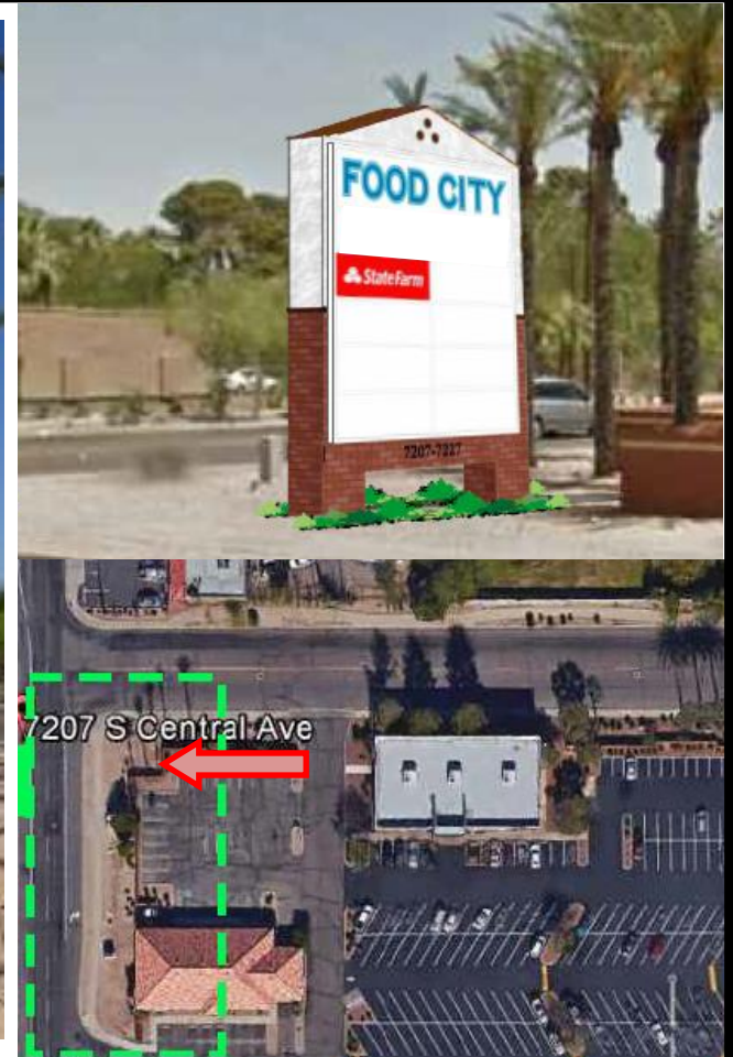
Location of New Monument Sign