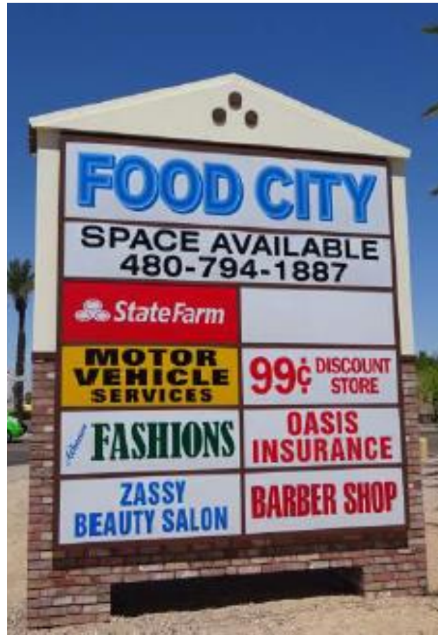
New Monument Sign