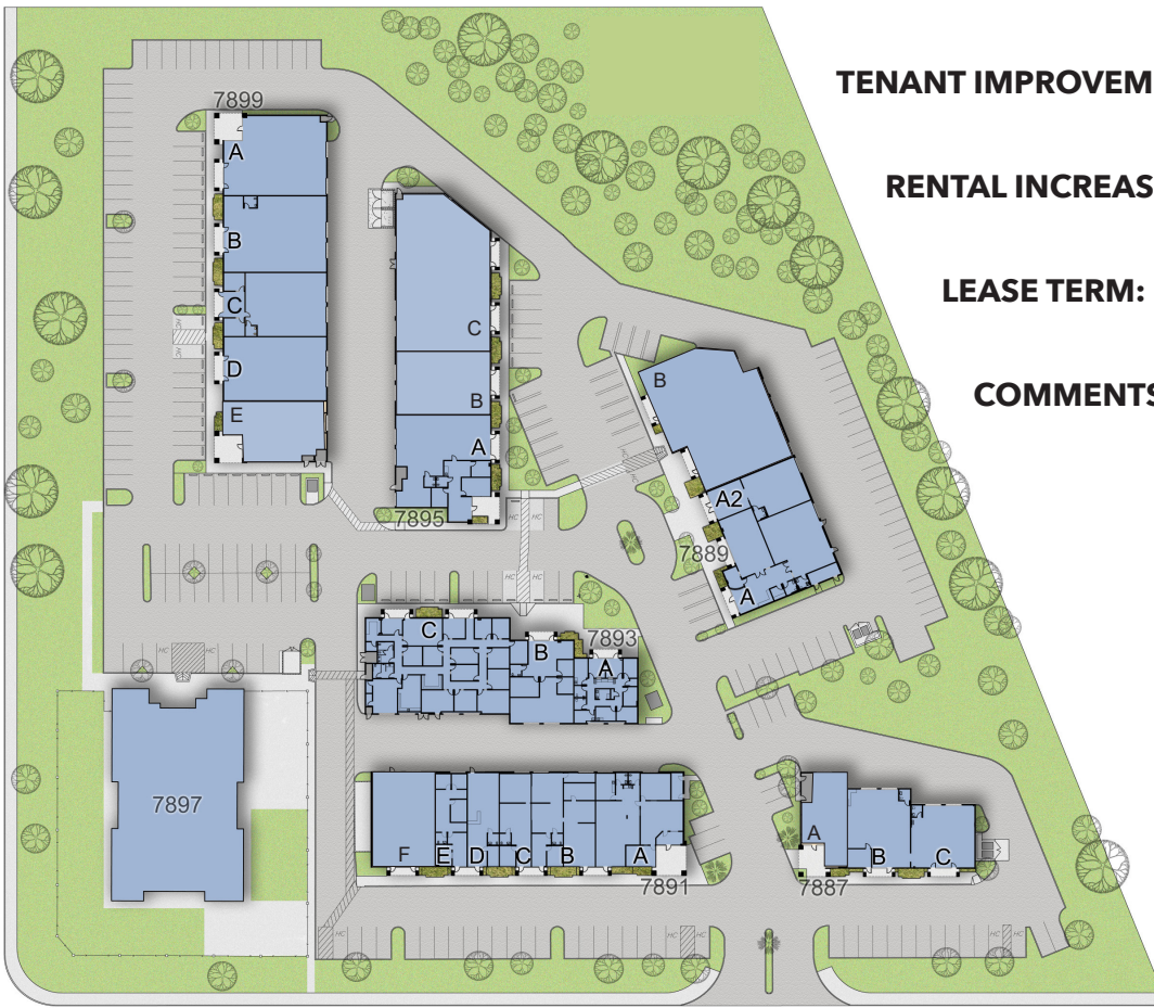
MISSION GROVE PARKWAY SOUTH