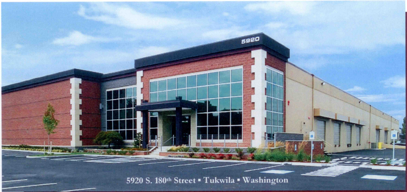
5920 S. 180 th Street • Tukwila • Washington