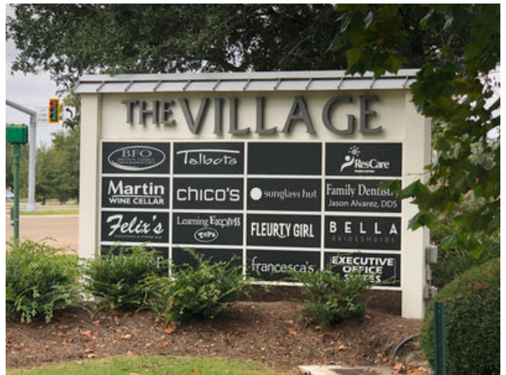
Edited to Show Updated Signage