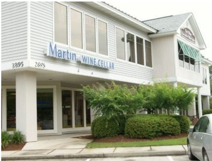
Martin Wine Cellar / Village Executive Suites