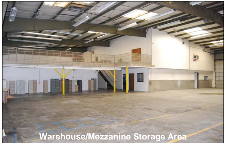
Warehouse/Mezzanine Storage Area