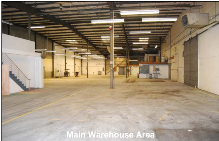
Main Warehouse Area