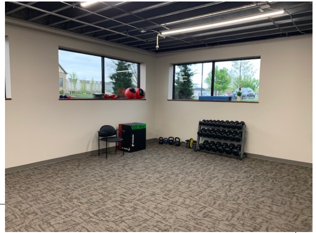
Ceiling and window conditions