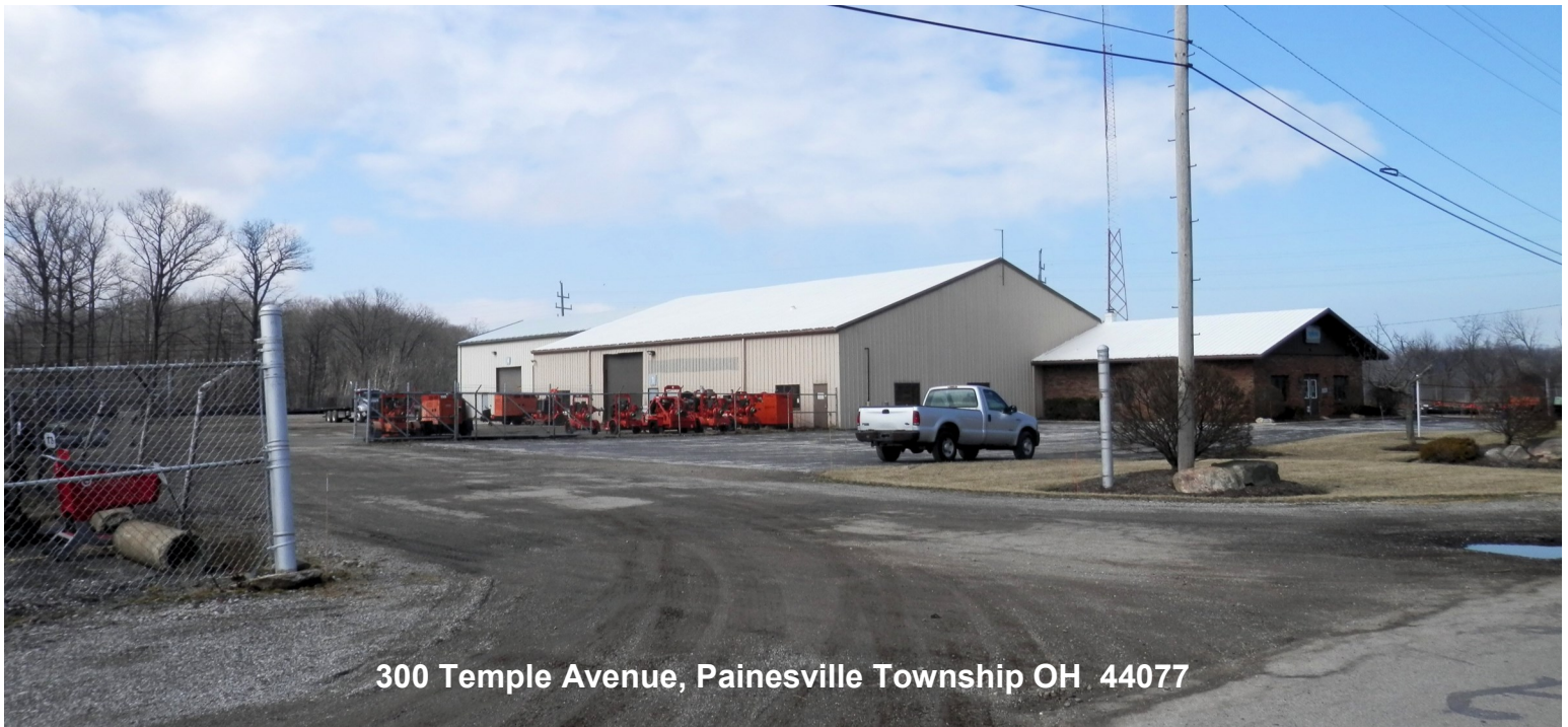
300 Temple Avenue, Painesville Township OH 44077