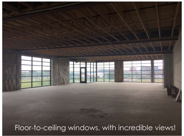
Floor-to-ceiling windows, with incredible views!