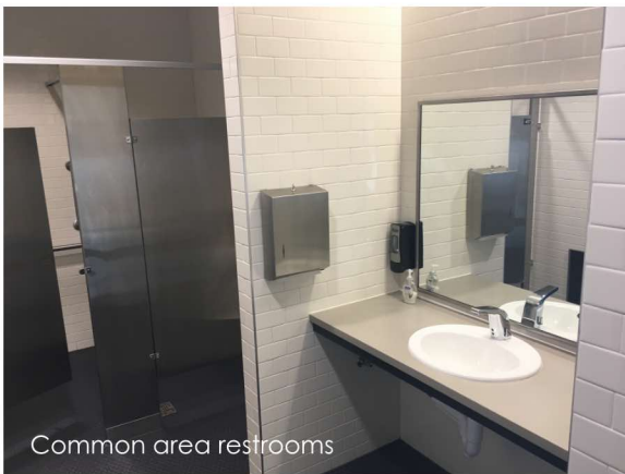
Common area restrooms