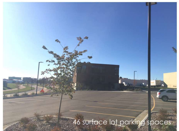
46 surface lot parking spaces