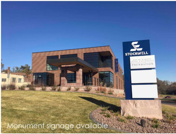
Monument signage available