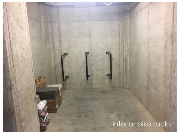
Interior bike racks