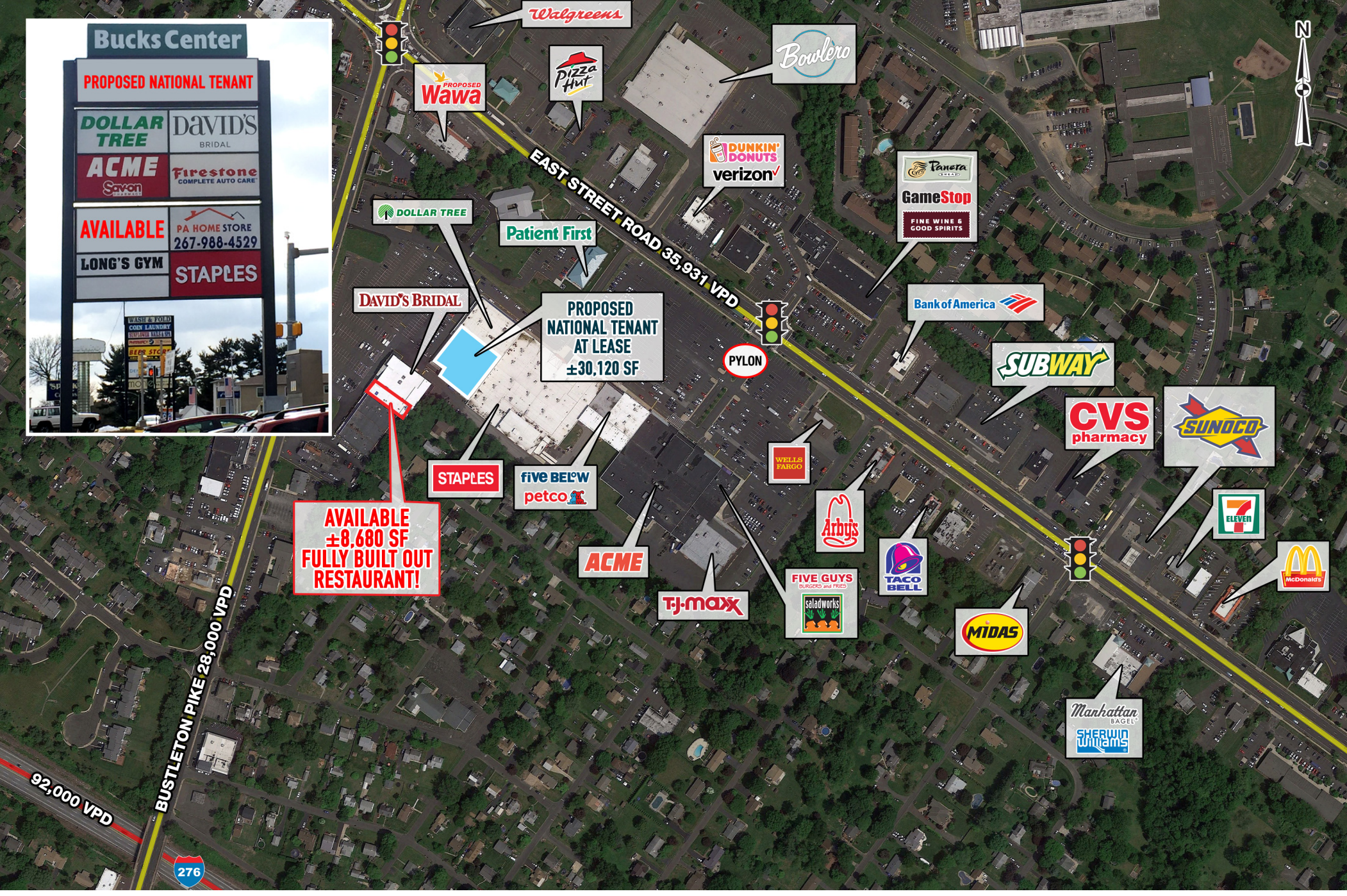
The information and images contained herein are from sources deemed reliable. However, Metro Commercial Real Estate, Inc. makes no representation whatsoever as to their accuracy or authenticity. Images shown may be modified for illustrative purposes. Images may be out-of-date and not current. 7.24.