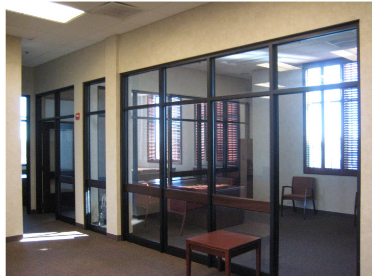
ABOVE STANDARD FINISH-OUT