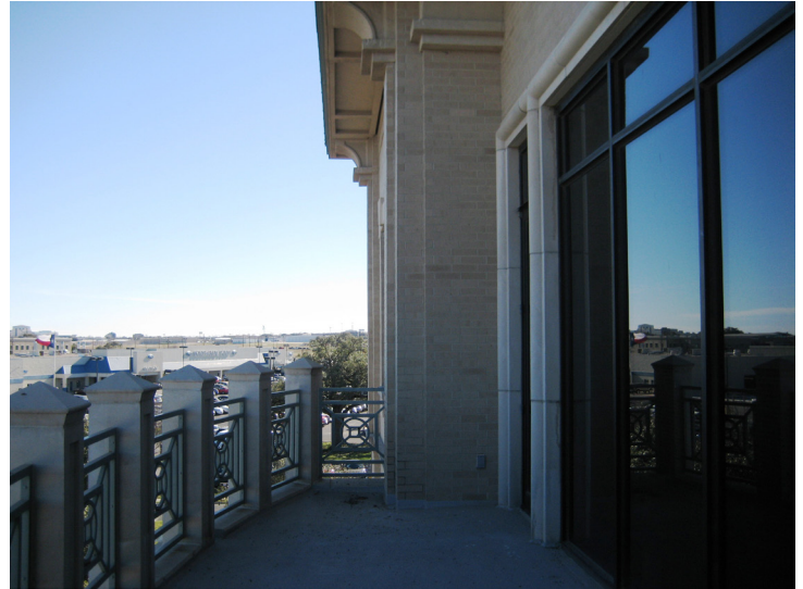
FANTASTIC BALCONYS AVAILABLE