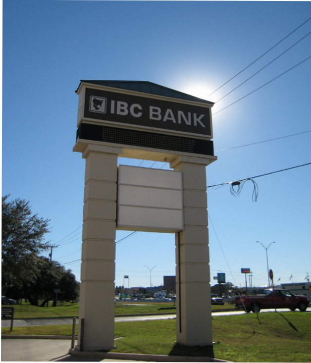
PYLON SIGNAGE AVAILABLE