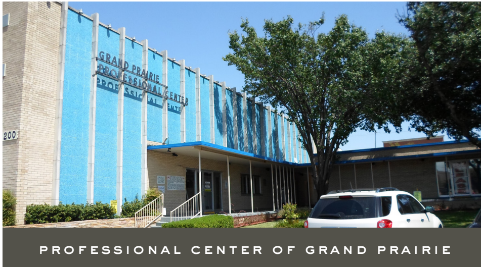
PROFESSIONAL CENTER OF GRAND PRAIRIE