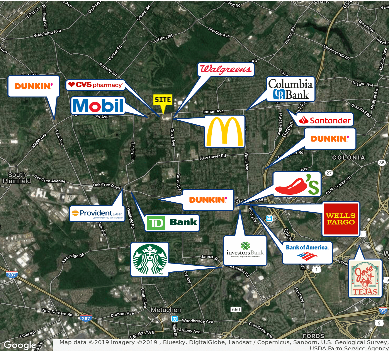
Map data ©2019 Imagery ©2019 , Bluesky, DigitalGlobe, Landsat / Copernicus, Sanborn, U.S. Geological Survey, USDA Farm Service Agency