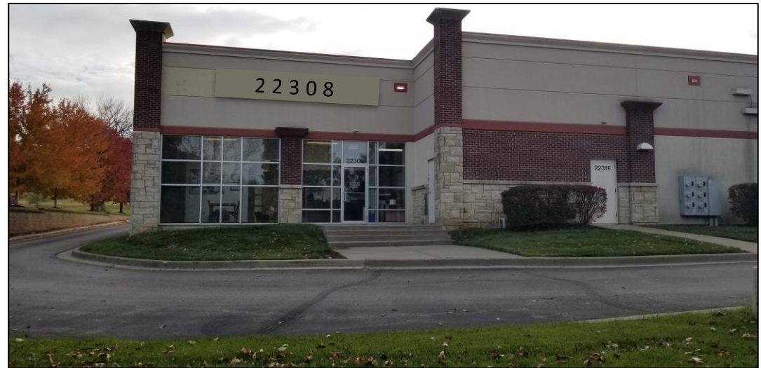
Back of building