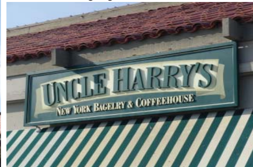
Uncle Harry's Bagels & Coffee