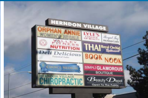
Signage on First Street