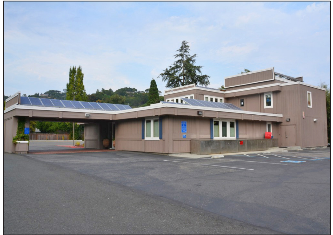
Back View of the Building

It's central location immediately adjacent the Bon Air Shopping Center, Highway 101 and Interstate 580 is arguably the best in Marin County. Approximately 16 miles to San Francisco. Approximately 11 miles to the east bay.