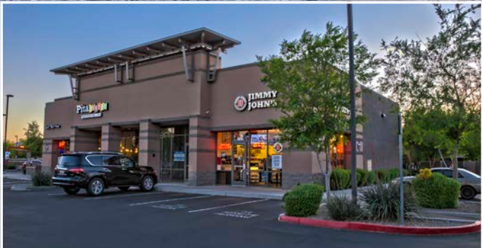
THE SHOPPES AT COTTON CENTER