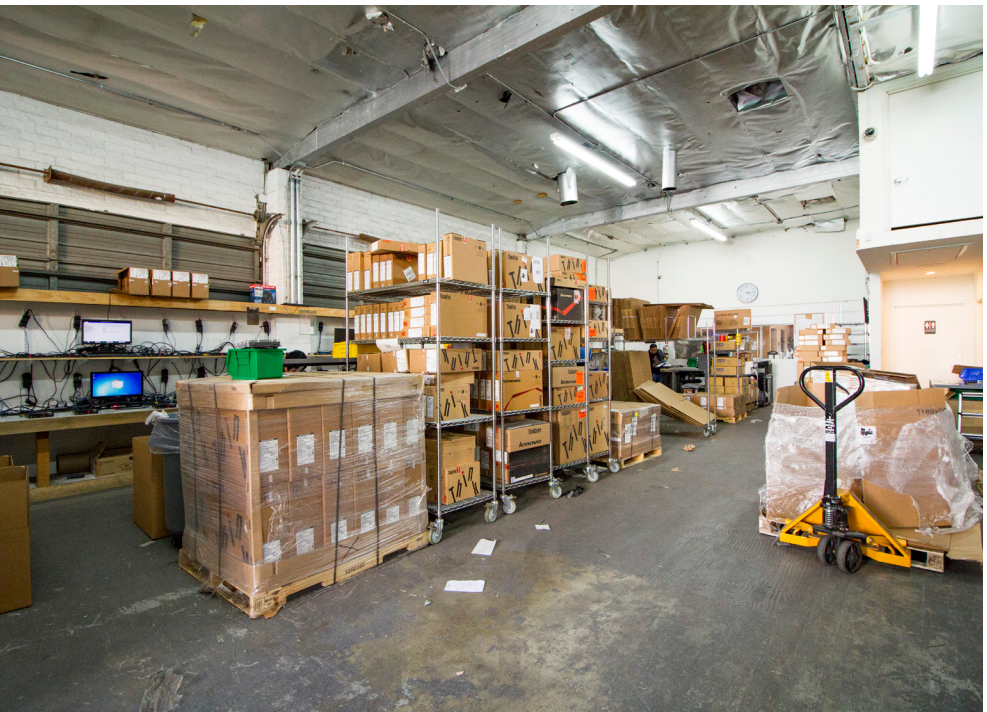
©2018 Madison Partners. DRE License Number 00978067. The information above has been obtained from sources believed reliable. While we do not doubt its accuracy, we have not verified it and make no guarantee, warranty or representation about it. It is your responsibility to independently confirm its accuracy and completeness. Any projections, opinions, assumptions, or estimates used are for example only and do not represent the current or future performance of the property. The value of this transaction to you depends on tax and other factors which should be evaluated by your tax, financial and legal advisors. You and your advisors should conduct a careful, independent investigation of the property to determine to your satisfaction the suitability of the property for your needs. Updated 05.14.18