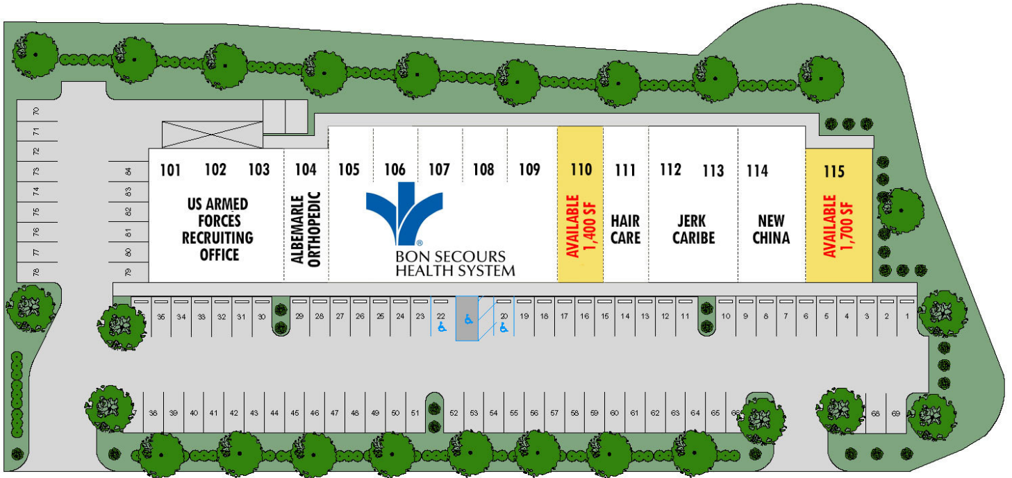
1 Front Elevation