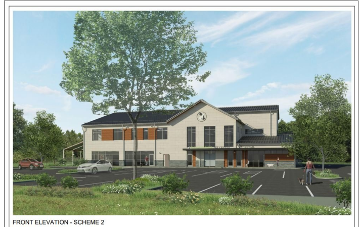
FRONT ELEVATION - SCHEME 2

Listing ID: 30507596 Status: Active Property Type: Retail-Commercial For Lease Retail-Commercial Type: Mixed Use, Street Retail Contiguous Space: 3,612 SF Total Available: 3,612 SF Gross Land Area: 3.40 Acres Lease Rate: $21.95 PSF (Annual) Base Monthly Rent: $6,606 Lease Type: NNN Nearest MSA: Bridgeport-Stamford-Norwalk County: Fairfield Tax ID/APN: 30-12-1 Zoning: R-1 AND SPECIAL DESIGN DISTRICT Road Type: Paved, 2-Track, Highway Property Visibility: Excellent Highway Access: Route 25 to I-84 at Exit 9, Exit 10, or Exit 11 Tenancy: Multiple Tenants Year Built: 2020 Construction/Siding: Block Parking Type: Surface