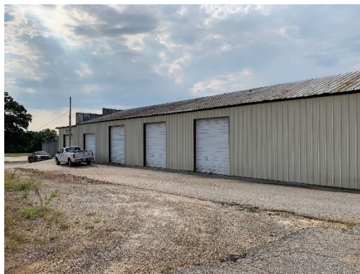
back building side view