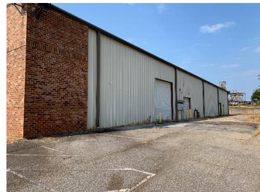
front building side view