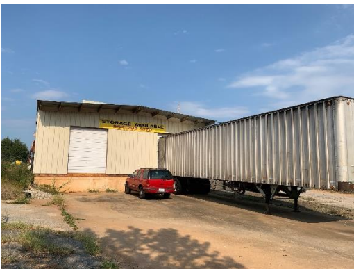
back building loading dock