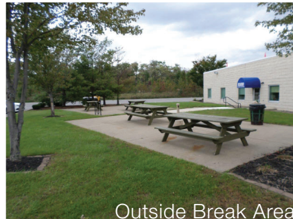
Outside Break Area