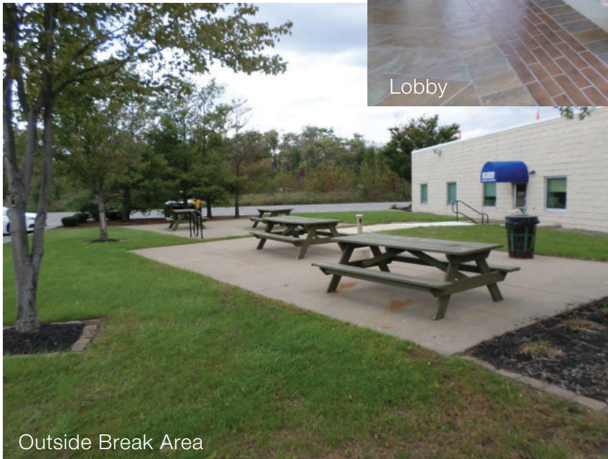
Outside Break Area